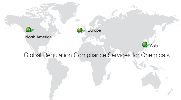
Global Regulation Compliance Services for Chemicals

As three companies: Hangzhou RUIO Technology Co., Ltd (RUIO) in China, REACH Compliance Services Limited (RCS) in Ireland and REACH North America Services Inc (RNAS) in Canada, the REACH24H Group provides round-the-clock chemical compliance services for clients all over the world. It has a large technical team with extensive experience in complying with international Technical Barriers to Trade (TBT) and has helped over 4000 enterprises successfully gain access to the European, American and Chinese markets.